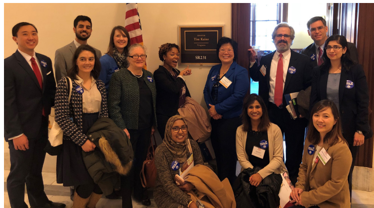
IFly-In group inside Tim Kaine's office